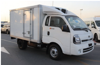
Cold Chain Freight Protection