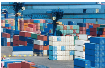
Asset Tracking & Protection